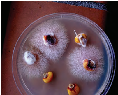
Figure 3. Fusarium infection on corn seeds.

The Organic Farming Research Foundation (OFRF) has funded three projects researching the ability of beneficial microbes to aid organic farming. Carr (2016) investigated the