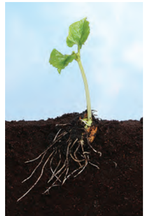
Figure 2. Seedling.

Bioremediation is an intentional process used to eliminate environmental pollutants from contaminated sites (Madsen, 2003). Other contaminants that can be removed via bioremediation include those from industrial processes and hazardous waste. The process includes using microorganisms, fungi and plants to decompose, sequester or remove soil contaminants, such as agricultural pesticides and fertilizers (Figure 2).